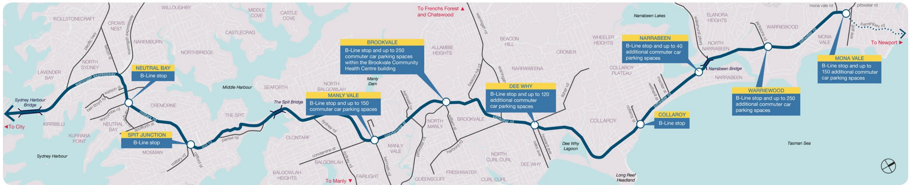
Proposed B-Line route, stops and commuter car parks